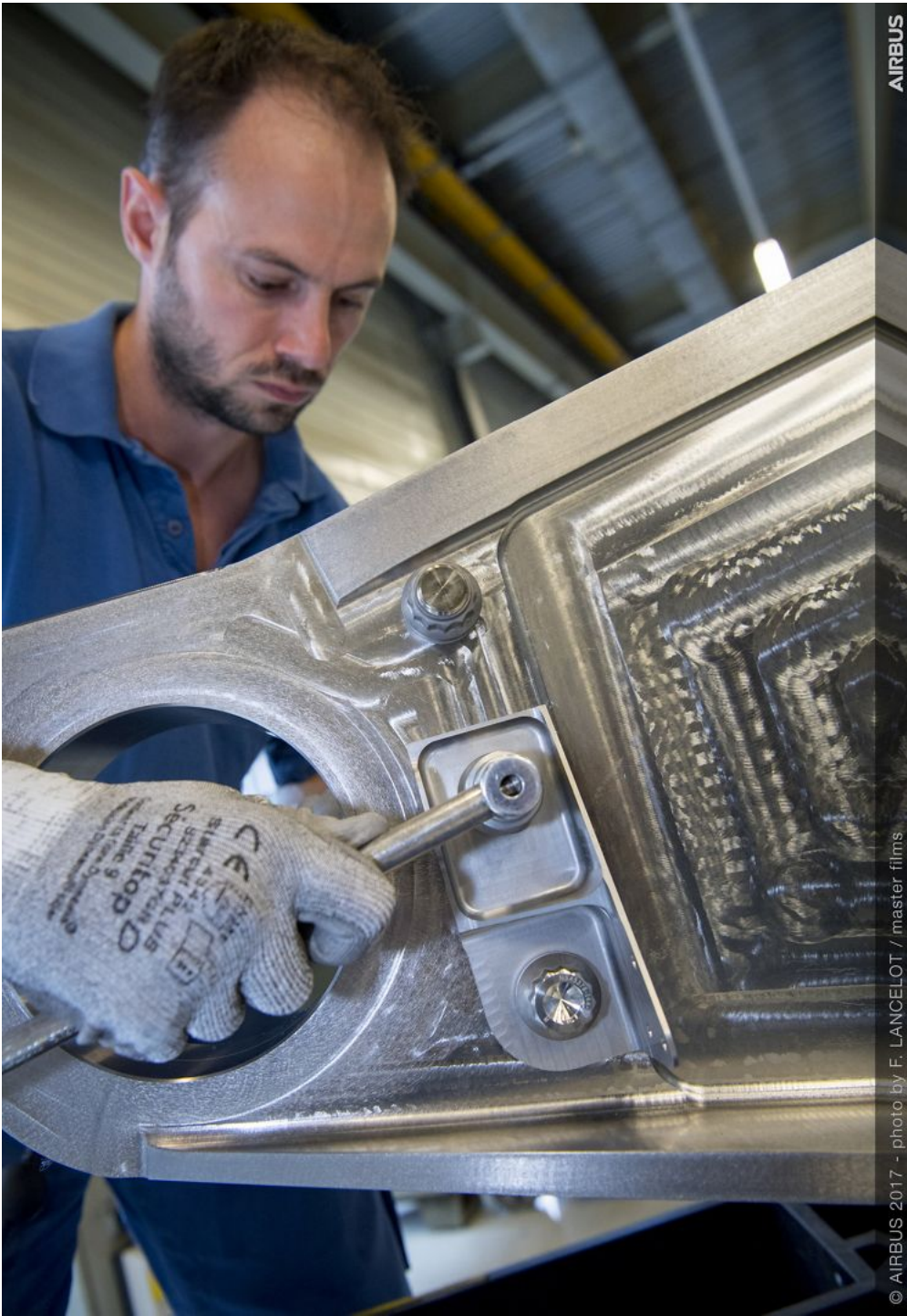
3D printed bracket installed on A350 XWB pylon