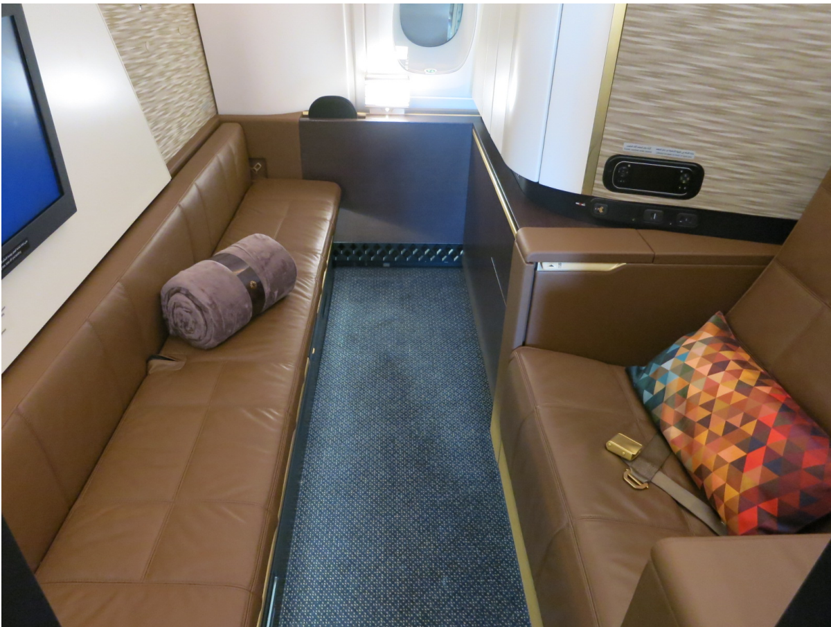
Etihad First Apartment