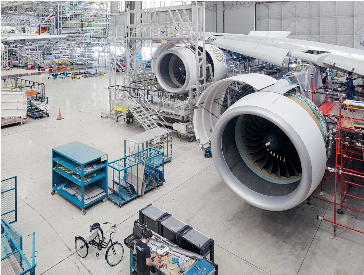
An Emirates A380 in for maintenance in Dubai.

More broadly, Clark concedes that Emirates’ emergence as a boundary-pushing titan of global aviation was an outcome of an era that may now be at an end. “It is true that we are a product of the multilateralism, the liberalization of trade,” he says in his office, the lazy ballet of taxiing aircraft visible on the tarmac just over his left shoulder. On his desk, he’s kept a collection of British newspapers from June 24, the day after U.K. voters rejected the liberal order by voting to leave the European Union. “But are we going back to the ’30s? No, no, no. The man, the woman in the street has been exposed to the good things, irrespective of faith, creed, gender, nationality, sexuality, it doesn’t make any difference. Everybody’s out there,” he says. “They can see the world is open to them. And I’m hoping that kind of sense will prevail. Maybe I’m just being a little bit naive, overoptimistic.” He spoke on Oct. 26, 13 days before Trump’s election.